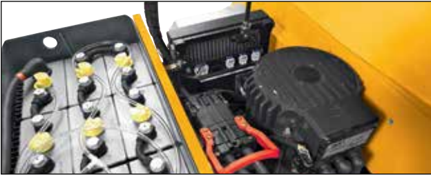
Factory warranty for added protection